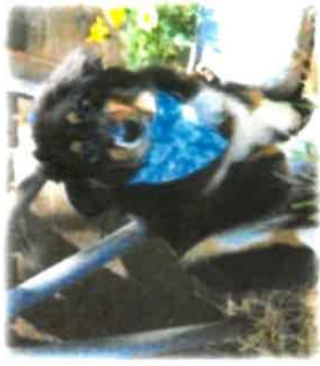
Mother: Arabia 12lbs