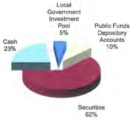
December 31, 2016