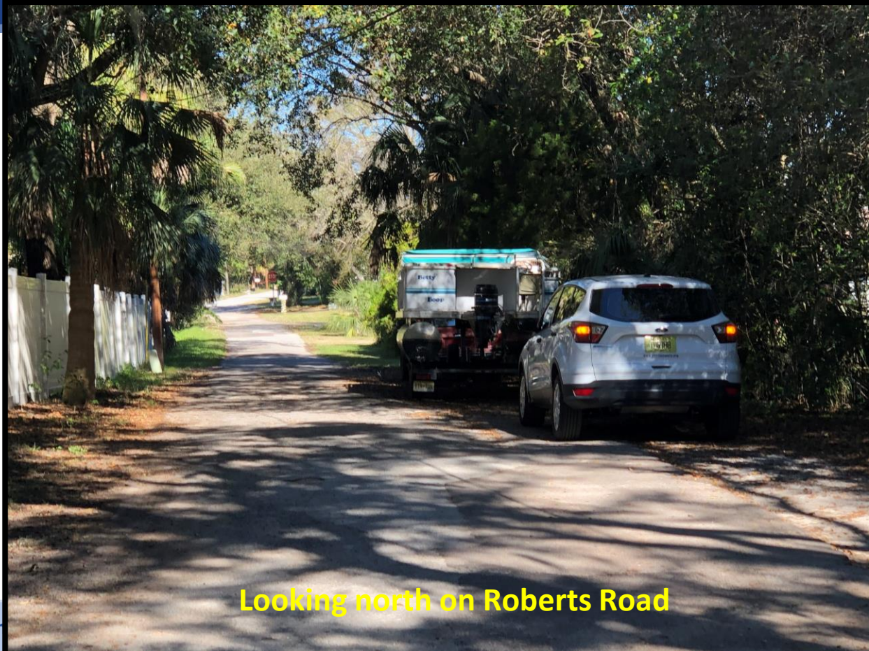
Looking north on Roberts Road