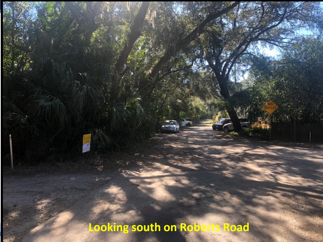
Looking south on Roberts Road