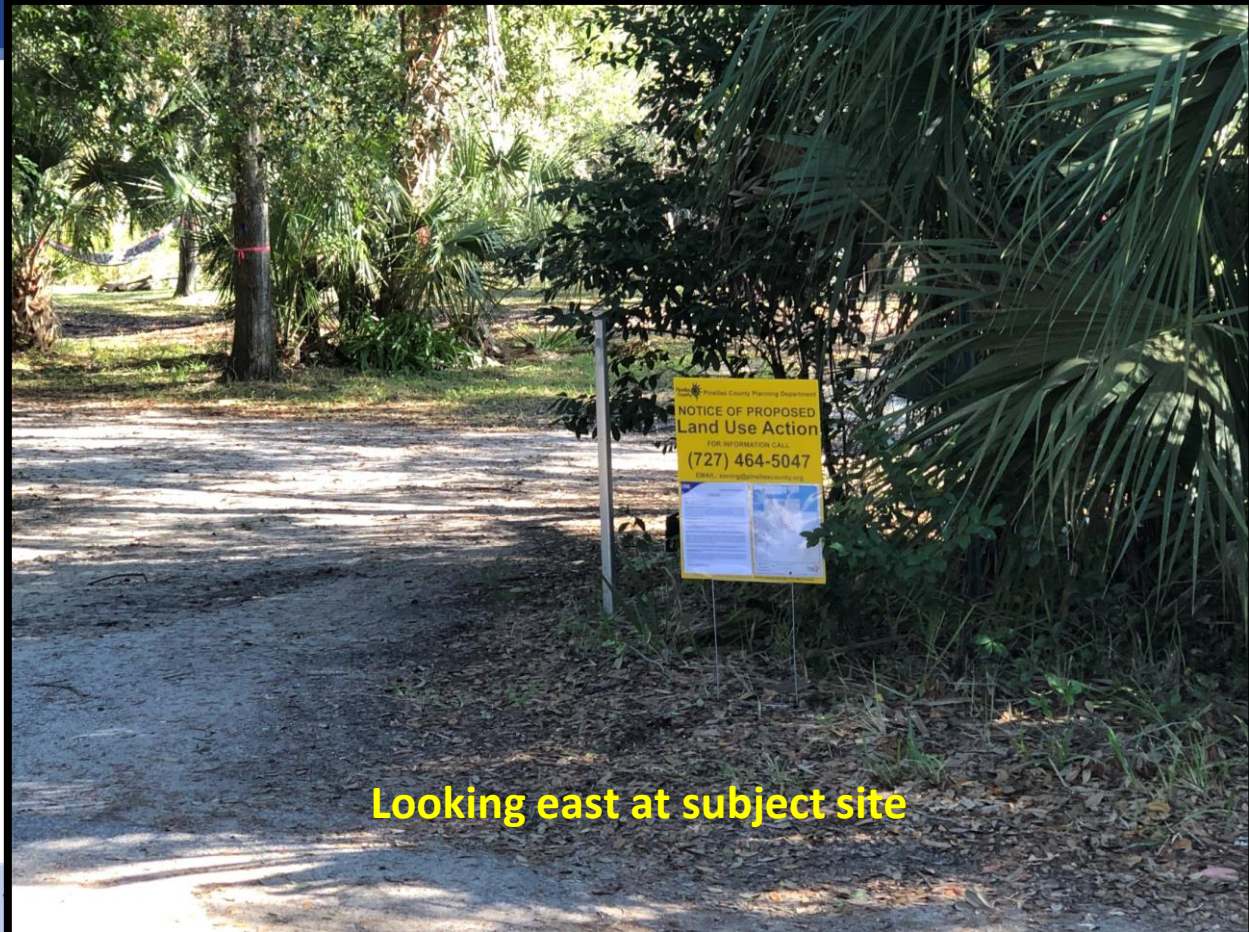
Looking east at subject site