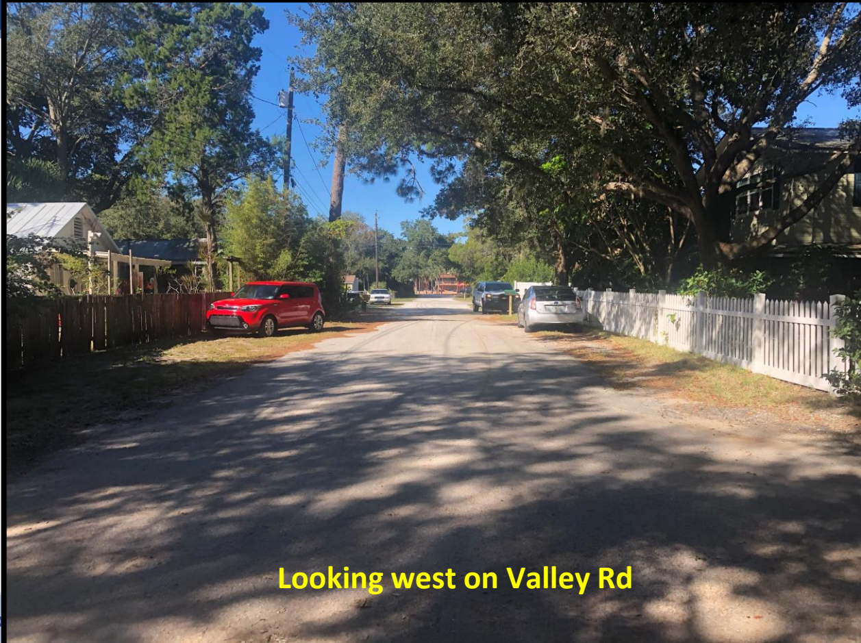
Looking west on Valley Rd