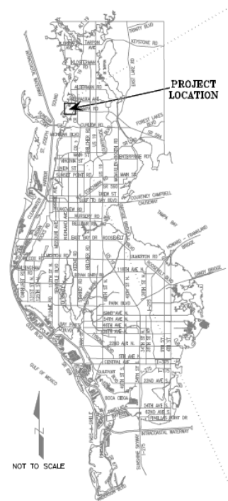
PINELLAS COUNTY MAP