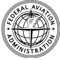
EXHIBIT E - FAA CONTRACT PROVISIONS