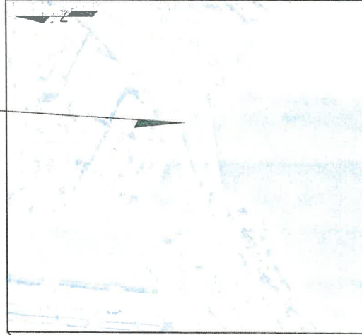
SECTION 00, TOWNSHIP 31 SOUTH, RANGE 16 EAST