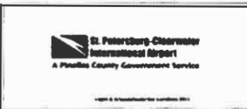
EXHIBIT "A" RENTAL CAR COUNTER AREA LOCATIONS

Date: April 8/ 2011 Req. Dept: Airport Real Estate Drawn/Edited by: jbn