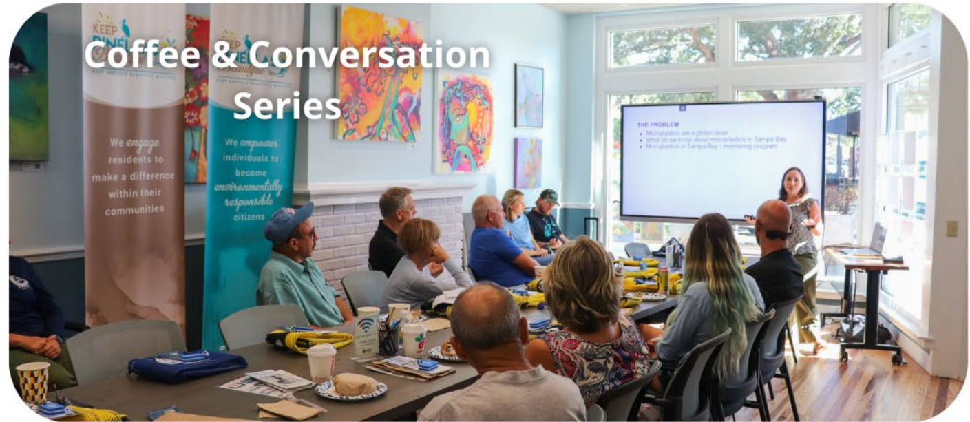
Coffee & Conversation Series

We engage residents to make a difference within their communities