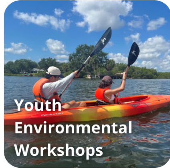
Youth Environmental Workshops