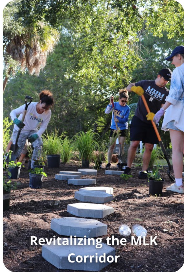
Revitalizing the MLK Corridor