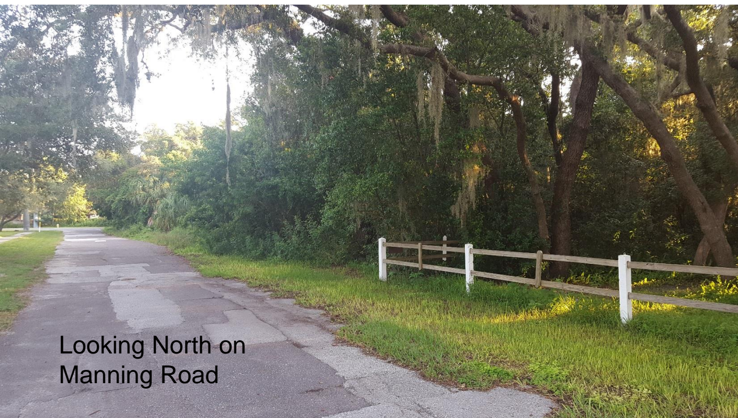
Looking North on Manning Road