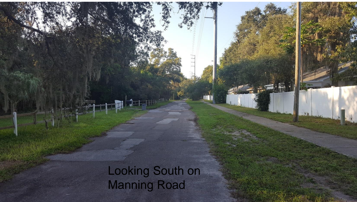
Looking South on Manning Road