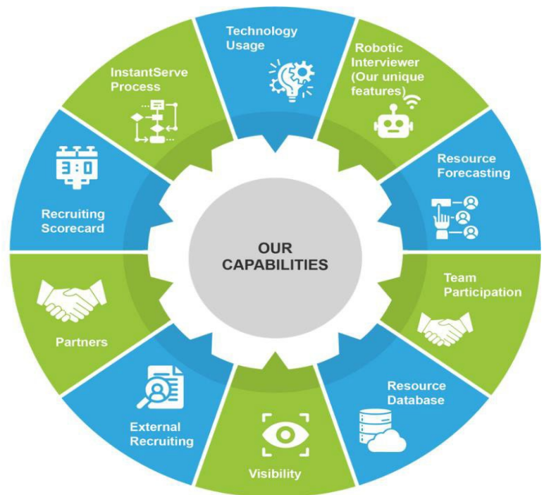
Figure 2: InstantServe – Value additions