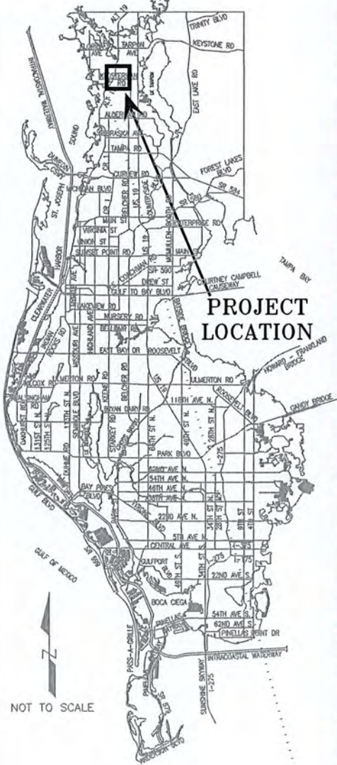
PINELLAS COUNTY MAP