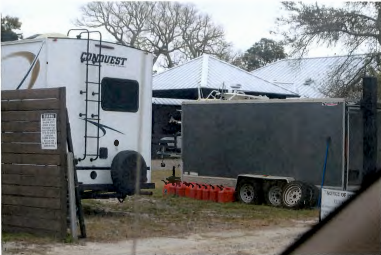
ENTRY OF RIGHT OF WAY AT 86TH AVE N 01/23/2022

Ten (10) five (5 gal) gallon gas cans against a box trailer between that and an RV. Potentially 50 gallons of gasoline. Which and how many county ordinances does this violate? Flat trailer filled with building material & another tandem axel box trailer.