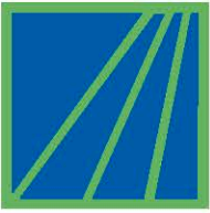
Exhibit A Schedule of Rate Values Montgomery Consulting Group, Inc.