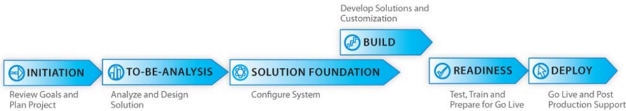
Figure 1 - Accela Methodology

As illustrated in the figure above, the stages of project delivery flow in linear direction, although many tasks run in parallel as appropriate to avoid unnecessary project delays. Each stage has pre-defined objectives, tasks and associated deliverables. Depending on the exact scope of the project, a full complement or subset of all available deliverables will be delivered through the services defined for the project. Employing this deliverables-based approach ensures that Accela and the Agency understand the composition and 'downstream' impact of each project deliverable to ensure the project is delivered with quality and in a timely manner.