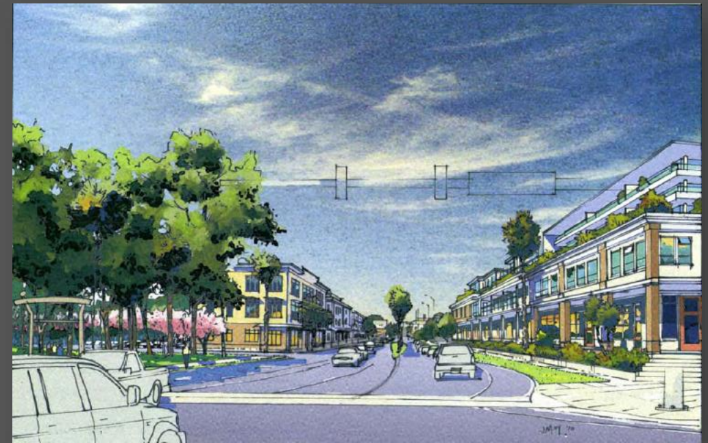
Community Redevelopment District