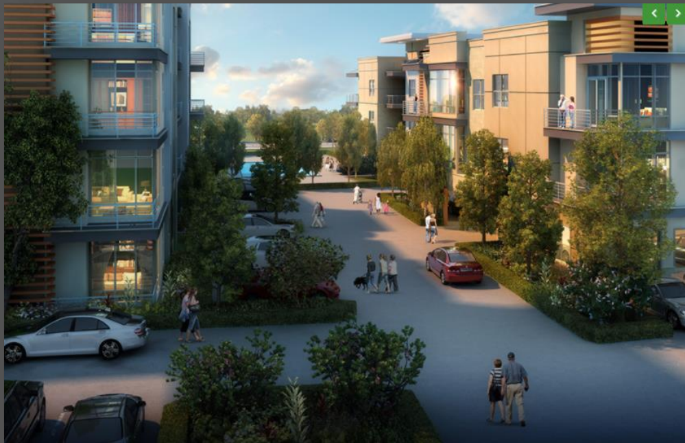
Meres Town Center Special Area Plan