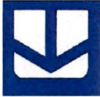
EXHIBIT B FEE SCHEDULE

Proposed 178-0525-NC (SS), Countywide Resurfacing, Restoration, and Rehabilitation Paving