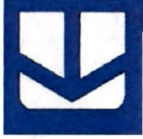
EXHIBIT B FEE SCHEDULE

Proposed 178-0525-NC (SS), Countywide Resurfacing, Restoration, and Rehabilitation Paving