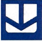
EXHIBIT B FEE SCHEDULE

Proposed 178-0525-NC (SS), Countywide Resurfacing, Restoration, and Rehabilitation Paving