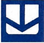
EXHIBIT B FEE SCHEDULE

Proposed 178-0525-NC (SS), Countywide Resurfacing, Restoration, and Rehabilitation Paving