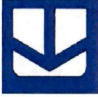
EXHIBIT B FEE SCHEDULE

Proposed 178-0525-NC (SS), Countywide Resurfacing, Restoration, and Rehabilitation Paving