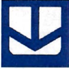
EXHIBIT B FEE SCHEDULE

Proposed 178-0525-NC (SS), Countywide Resurfacing, Restoration, and Rehabilitation Paving