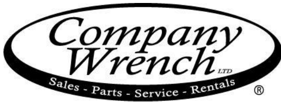
EXHIBIT C - PRICING PROPOSAL

Company Wrench 777 Laura Road Lakeland, FL 33815 USA 863-640-2420 (Phone)