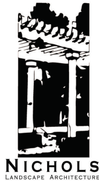
EXHIBIT A – Rate Schedule