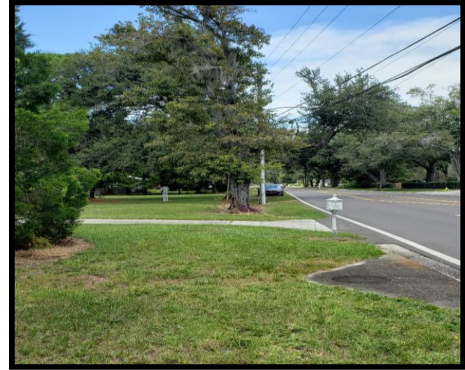
Looking to the north along Riviere Rd.