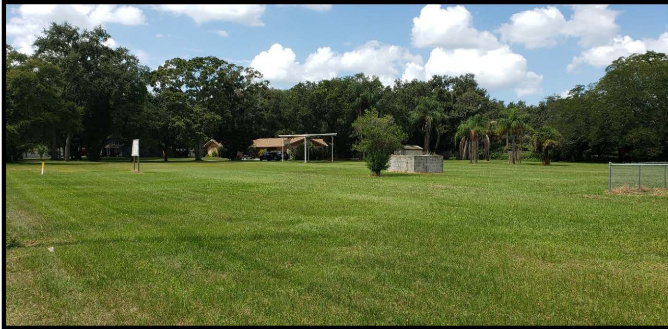
Looking northwest at subject site from Tampa Rd.