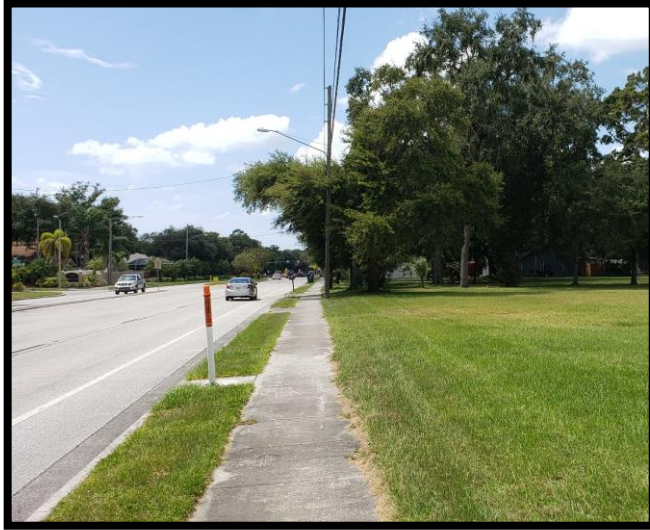
Looking to the west along Tampa Rd.