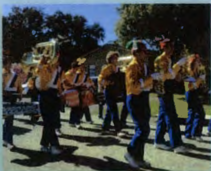
An Old Fashioned Christmas Parade

Three events were sponsored through the program in Fiscal Year 2016.