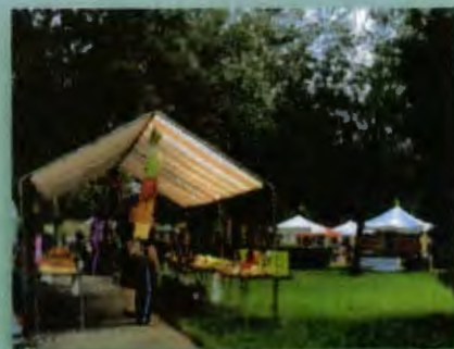
Largo Downtown Market at Ulmer Park