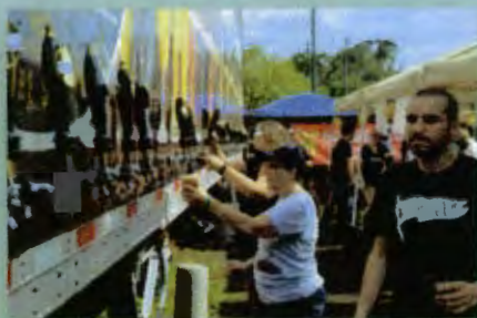
Barley Mow Brewing Company Anniversary Event