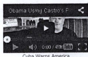
Cuba Warns America

BRIT'S JEWS SLAVE PERFECT UNION is THEVENY GOVERNMENT is COUNTERFEIT.