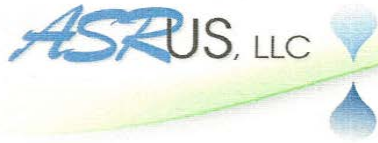
Exhibit A - SCHEDULE OF RATE VALUES Subconsultant: ASRus, LLC