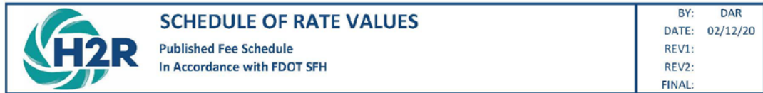
Exhibit A – Schedule of Rate Values Subconsultant: H2R Corp