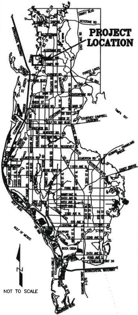
PINELLAS COUNTY MAP