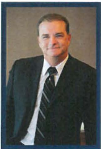
MAYOR Eric Seidel

The Oldsmar City Council shall be the Community Redevelopment Agency. The Community Redevelopment Agency shall have all powers enumerated under F.S.CH 163, PT.III, and as delegated by the Pinellas County Board of County Commissioners by Pinellas County Resolution No. 95-195.