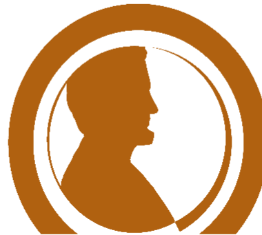
PENNY FOR PINELLAS