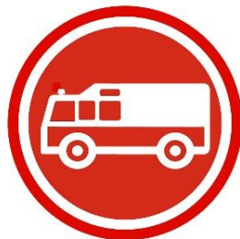
Safe, Secure Community