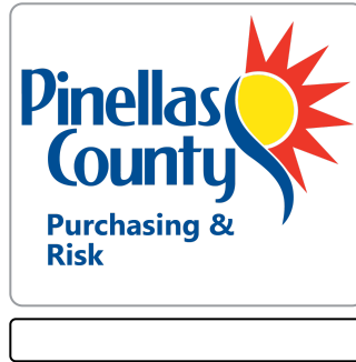
EXHIBIT F - SPECIAL TERMS AND CONDITIONS