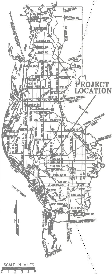
PINELLAS COUNTY MAP