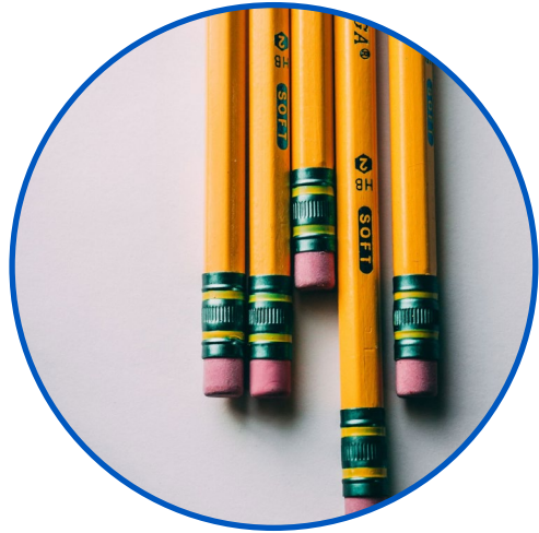
School System Staff