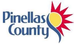
EXHIBIT IV EMERGENCY SOLUTIONS GRANT COMMUNITY HOUSING ASSISTANCE PROGRAM (CHAP) CHAP HOUSING STABILIZATION PLAN