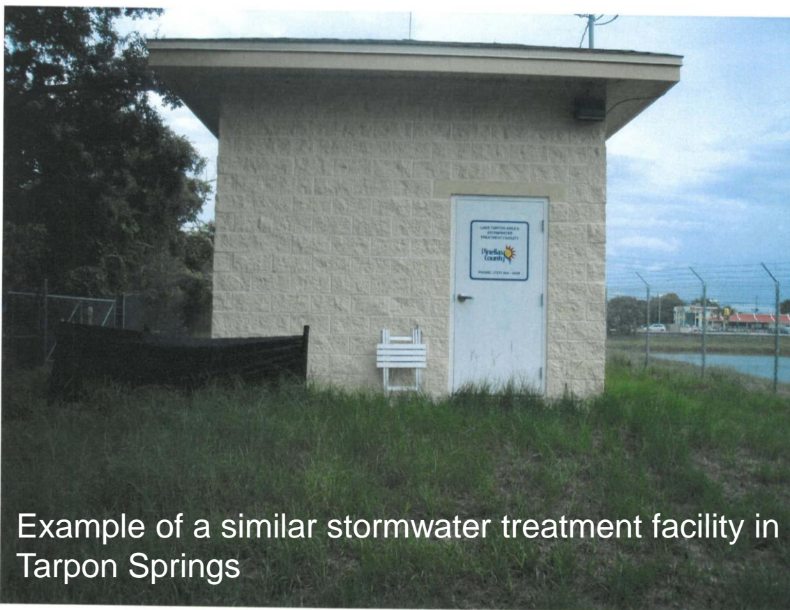
Example of a similar stormwater treatment facility in Tarpon Springs