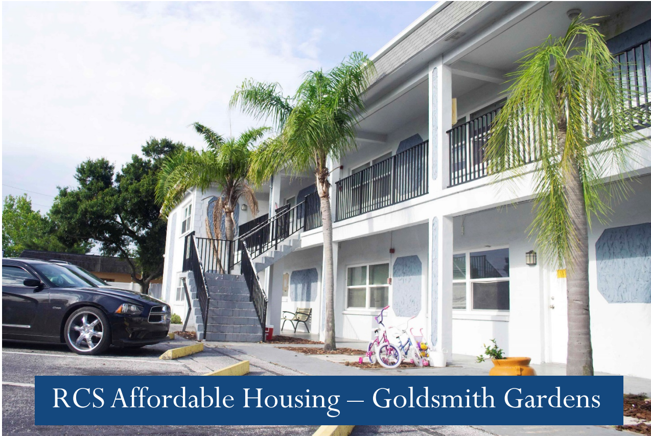
RCS Affordable Housing – Goldsmith Gardens