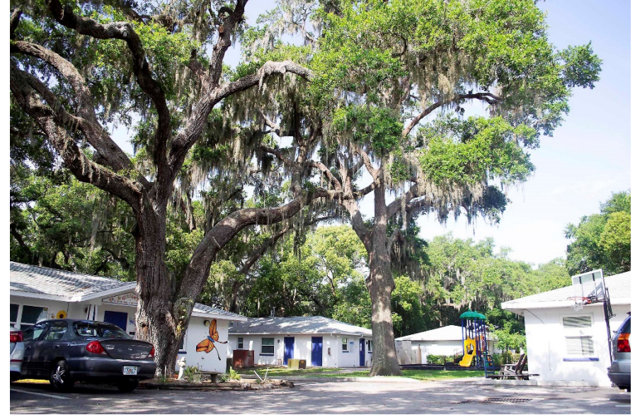
RCS Grace House