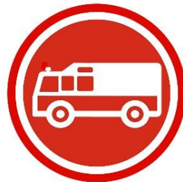
Safe, Secure Community