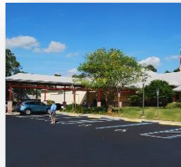
Palm Harbor Activity Center