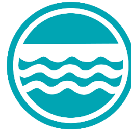
Water Quality, Flood & Sewer Spill Prevention