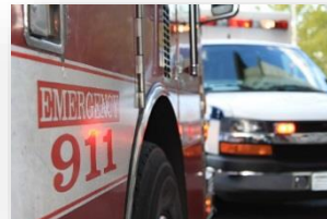
Public Safety Vehicles