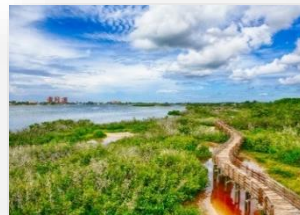
Boca Ciega Millennium Park