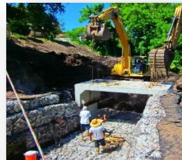
Bee Branch Flood Control