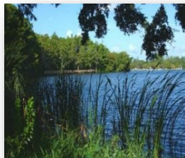
Lake Tarpon Water Quality