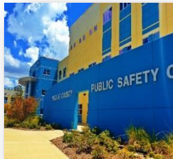
Public Safety Complex