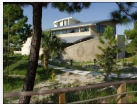
Weedon Island Center