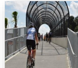
Pinellas Trail Loop