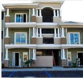
Land for Garden Trail Apartments