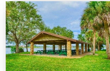
Park Facility Upgrades