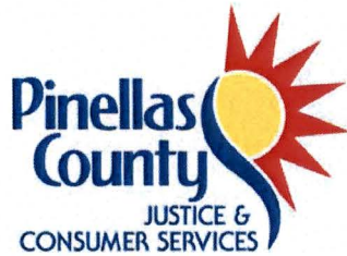
EXHIBIT #1 SCOPE OF SERVICES