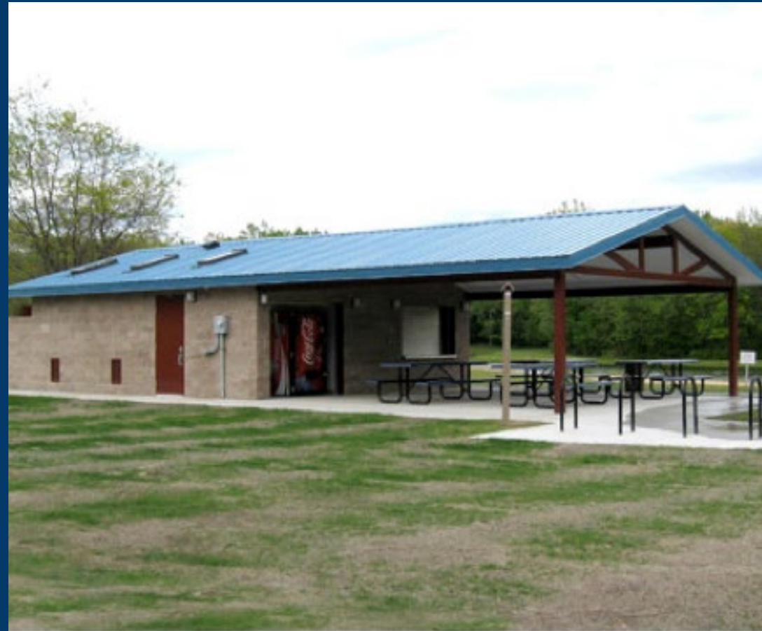
NEW CONCESSION BUILDING/RESTROOMS