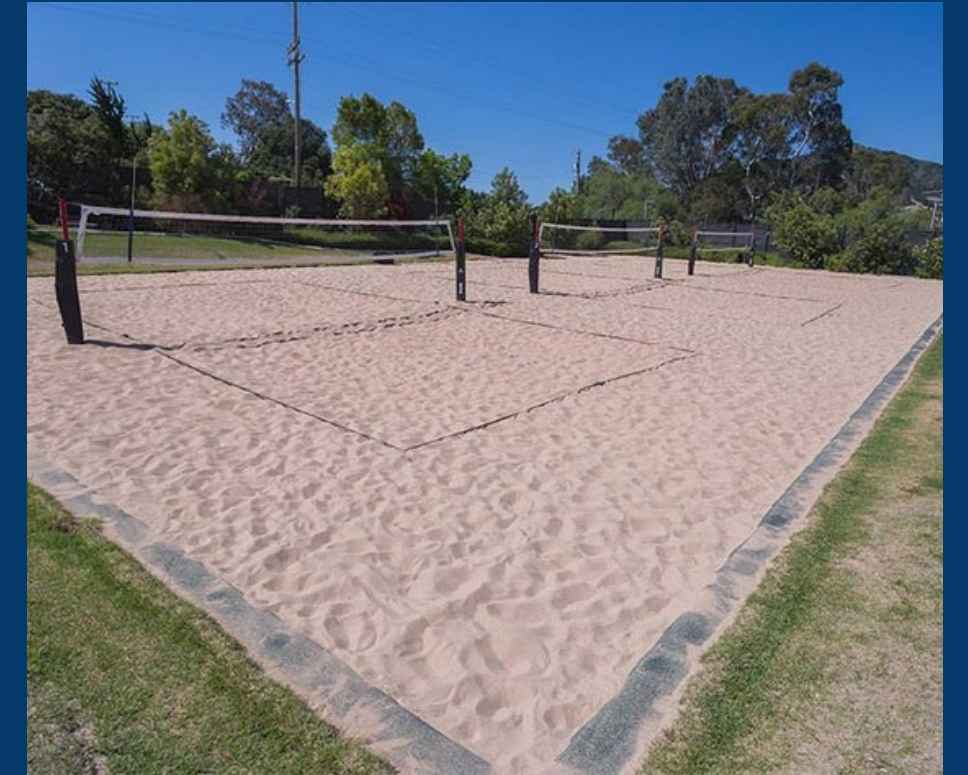
SAND VOLLEYBALL COURTS