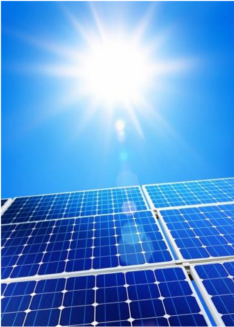
Investments in Solar