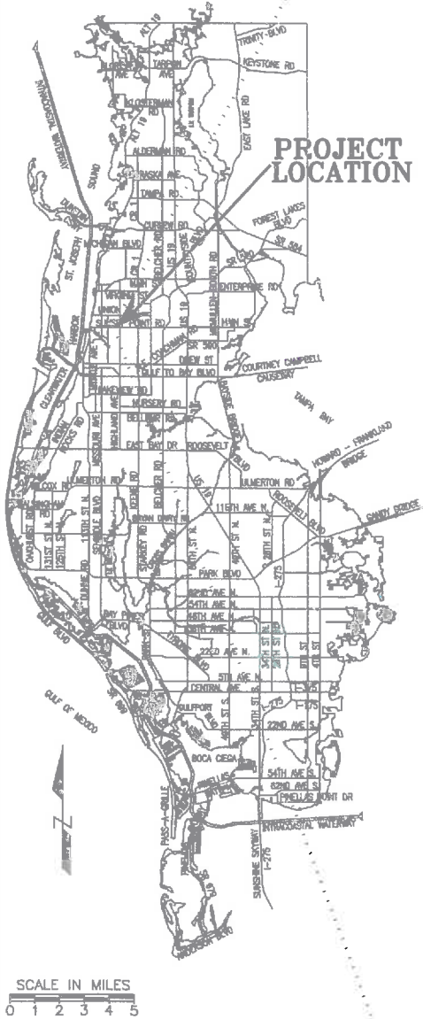
PINELLAS COUNTY MAP