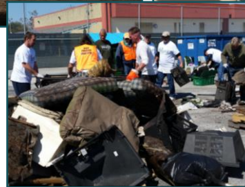
Take a Bite Out of Grime